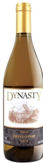
Bronze award in the Widely Planted Chardonnay Category