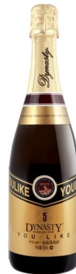
Seal of Approval in the Wine Pairing with Chinese Cuisine Category