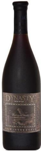
Best of Show Award International Grape Cabernet Sauvignon Category

Dynasty Dry Red Wine – Aged in Oak Barrels