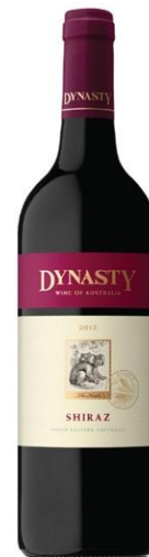
Silver Award Shiraz Around the World Category

Dynasty Wine of Australia Sauvignon Blanc