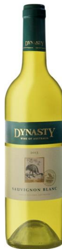
Silver Award A Cool Climate Collection Category

Dynasty Wine of Australia Sauvignon Blanc