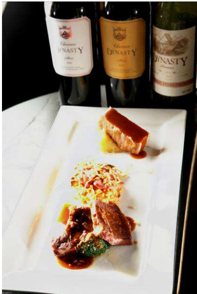
Western food pairing with by Dynasty wines